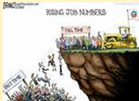
The Future for Ontario Colleges' Employees

I will have more to report after our Board Retreat October 9 th and 10 th and next meeting November 19 th , 2014. Until then, I hope your semester is off to a good start and running smoothly.